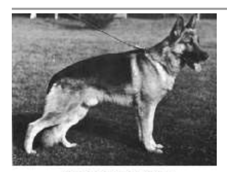
Canto von Arminius

In Germany a very active market developed for German Shepherd Dogs sought in countries such as Japan, Italy, Scandinavian countries, South America, France, and others. The SV matured with innovation such as the "a" stamp, a tattoo identification system, emphasis on producing bloodlines, and stricter regulations for top ratings given to dogs. In America the reverse happened as show status was emphasized, professional handlers began to control the sport and systems such as the Futurity/Maturity system emphasized early breeding of dogs before their true genetic worth became clear.