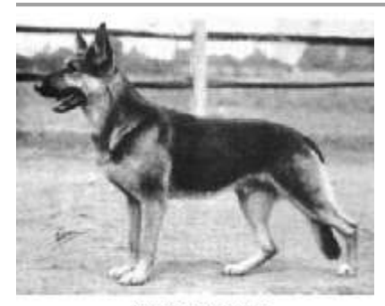
Pfeffer v Bern