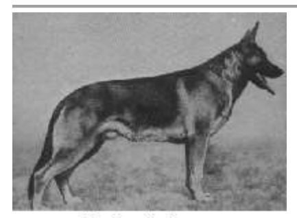
Klodo v Boxberg